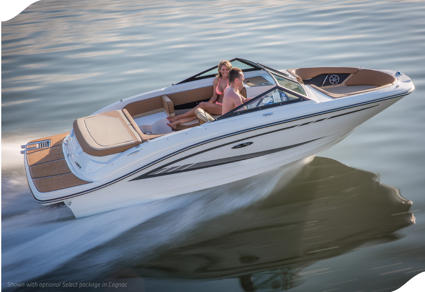
Shown with optional Select package in Cognac